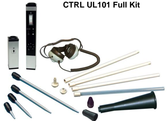
CTRL UL101 Full Kit